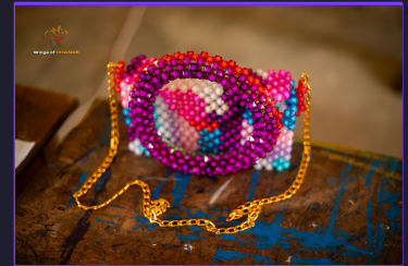
Bead Handbag $20