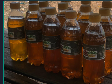
Palm Kernel Oil $12