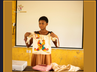
Local Clothes $15.99