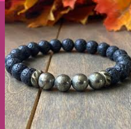
Ghanaian Bracelet $5.97

Mentorship, seed funding ($500), annual startup competition